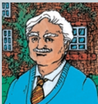
Colonel Marmaduke ARBUTHNOT Retired – was an officer in India under Lord Westmorland's command – knows quite a lot about his past.