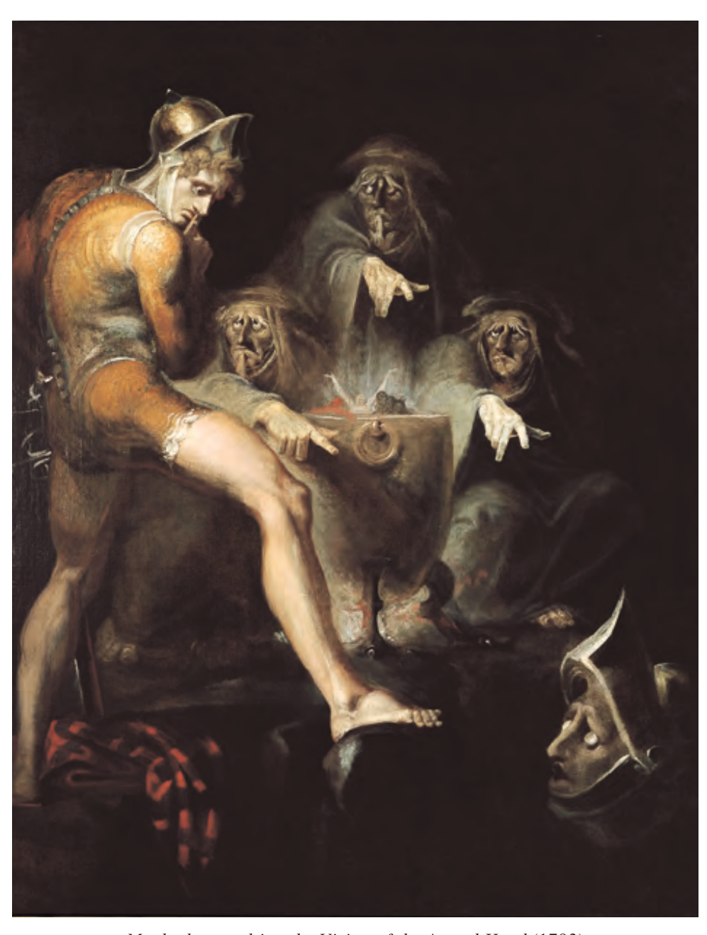
Macbeth consulting the Vision of the Armed Head (1793) by Henry Fuseli.