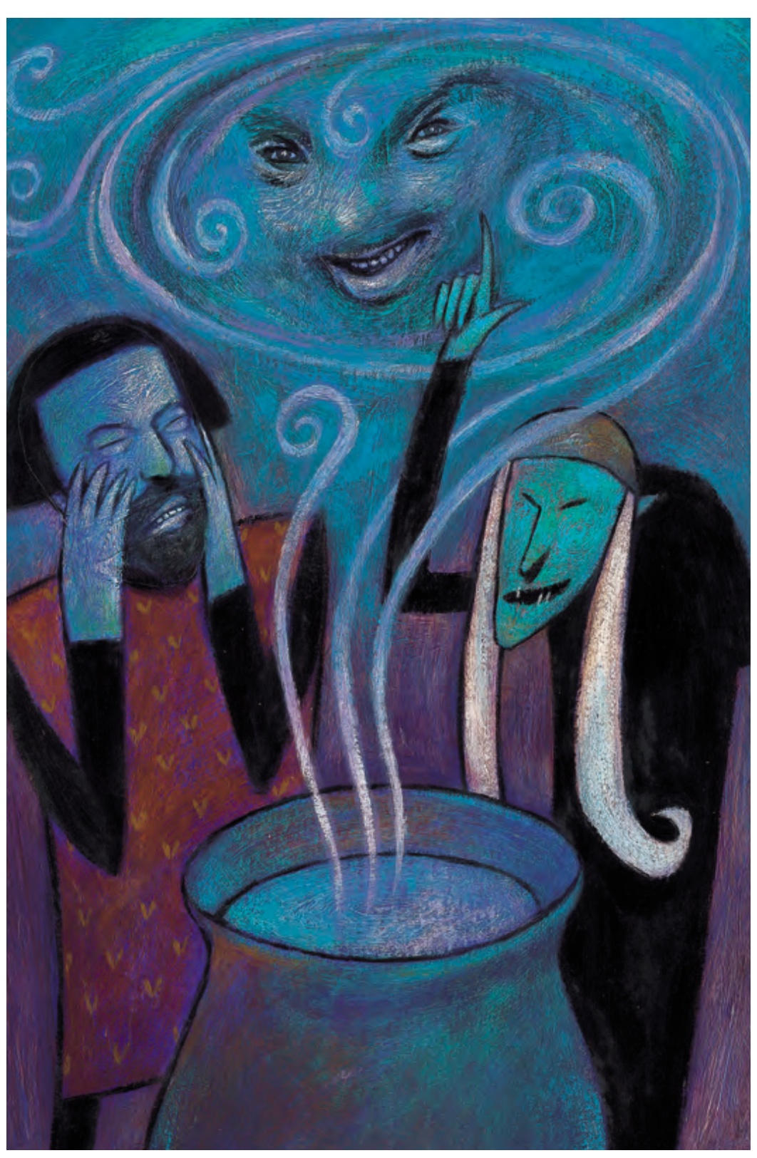
Out of the cooking-pot he saw a figure appear – it was Banquo!